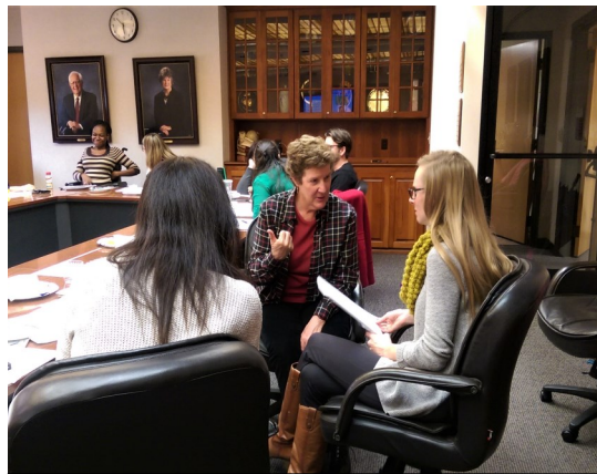
University Counseling and Health Center staff engage in SBIRT training role plays to become equipped with conducting SBIRT with college students they serve.