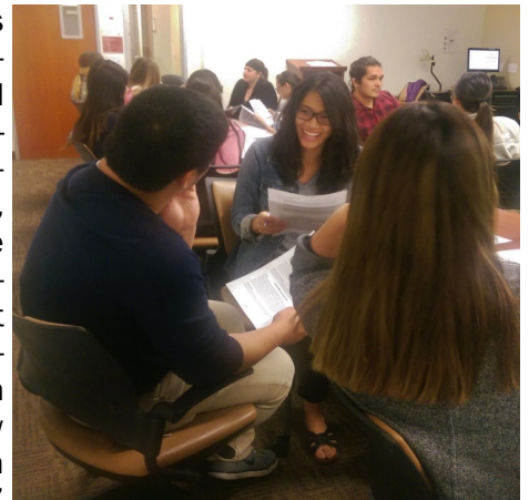
Students practice screening for alcohol and drug risk as part of the recommended, in-class practice portion of SBIRT training.

Beginning in January 2017, SBIRT training has been implemented in undergraduate and graduate programs for Psychology, Social Work, and Nursing programs at APU, along with faith-based university partners, including Fresno Pacific, Cal Baptist, Concordia Irvine, La Sierra, and Biola across respective disciplines. The training is delivered using an interactive, web-based learning management system (visit www.sbirtfaithandspirituality.org for the training). To date, well over 200 students have been trained. Results from satisfaction surveys show that the training has been well received, with the following areas reported as “very useful:” gaining knowledge about substance use disorders and SBIRT practice, the web-based, online training format, the integration of faith and spirituality, and the training video resources that show SBIRT practice in respective disciplines. Additionally, monthly Learning Community Webinars have been implemented for faculty and staff to provide technical assistance and education/information related to specific aspects of SBIRT practice. The goal of these webinars is to support the needs and concerns of our partners during the implementation of the SBIRT student training.